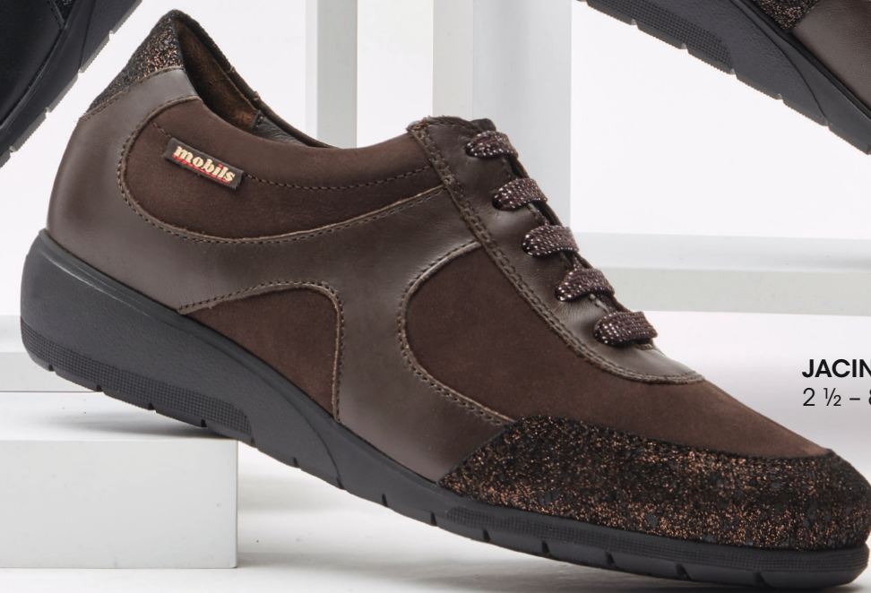
JACINTE • 2 ½ – 8 ½