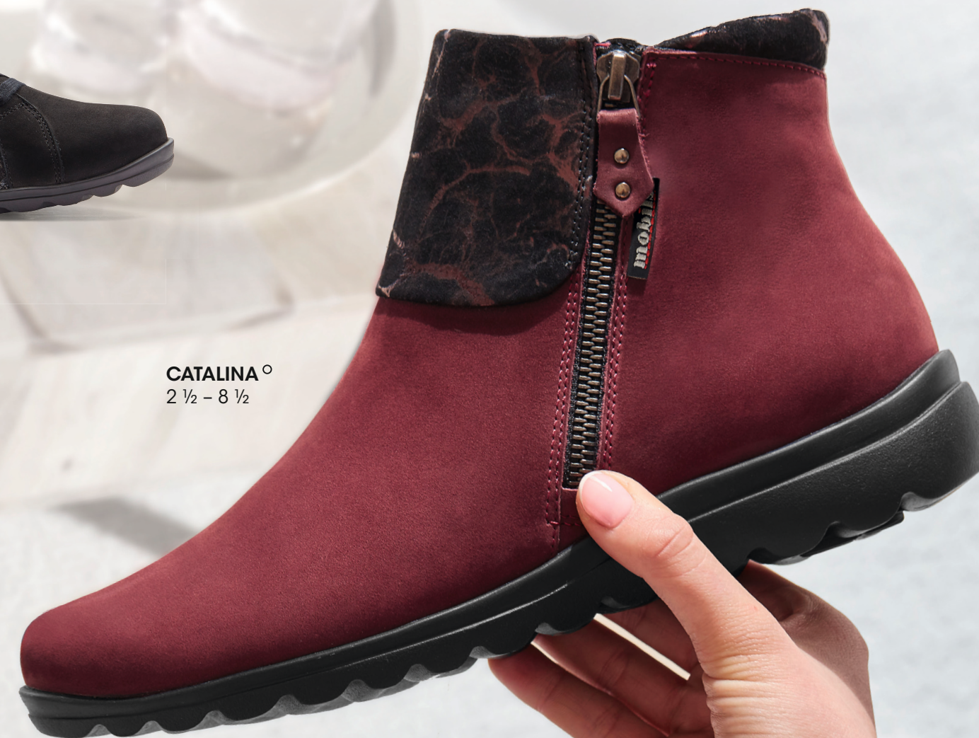
CATALINA ° 2 ½ – 8 ½

▼ The 100% natural rubber soles not only offer maximum cushioning but also provide excellent grip in winter.