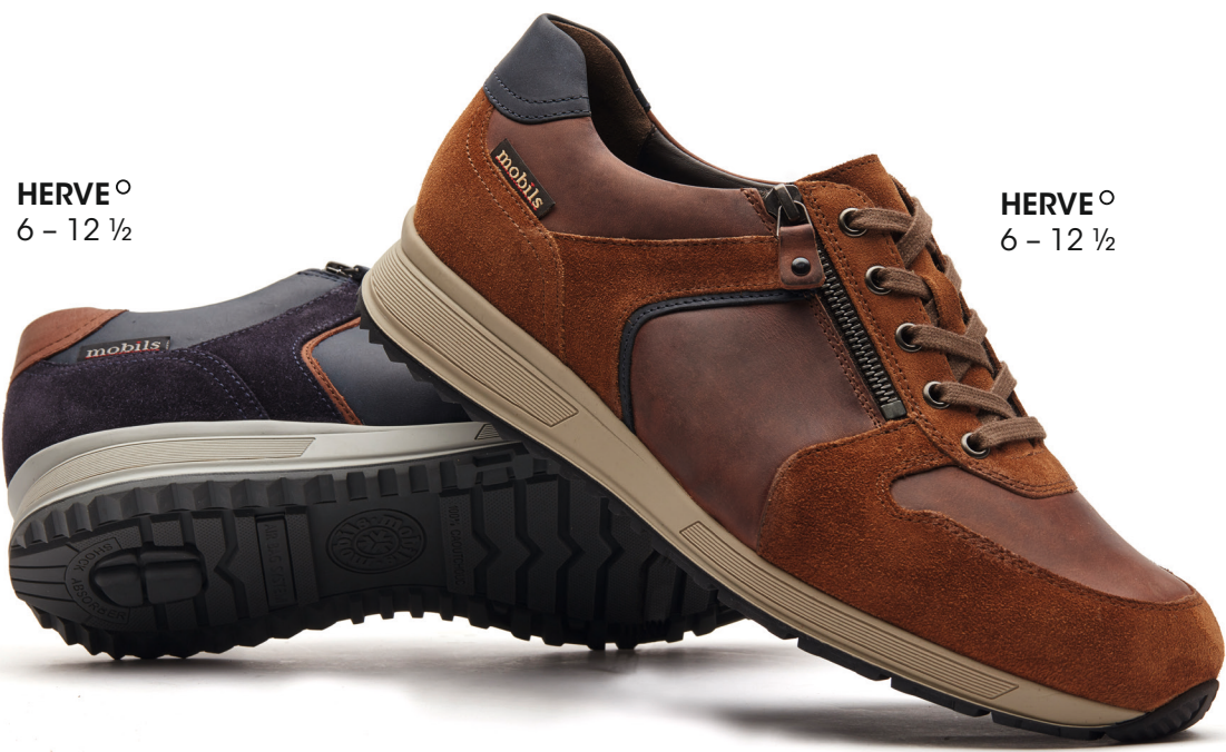
HERVE° 6 - 12 ½