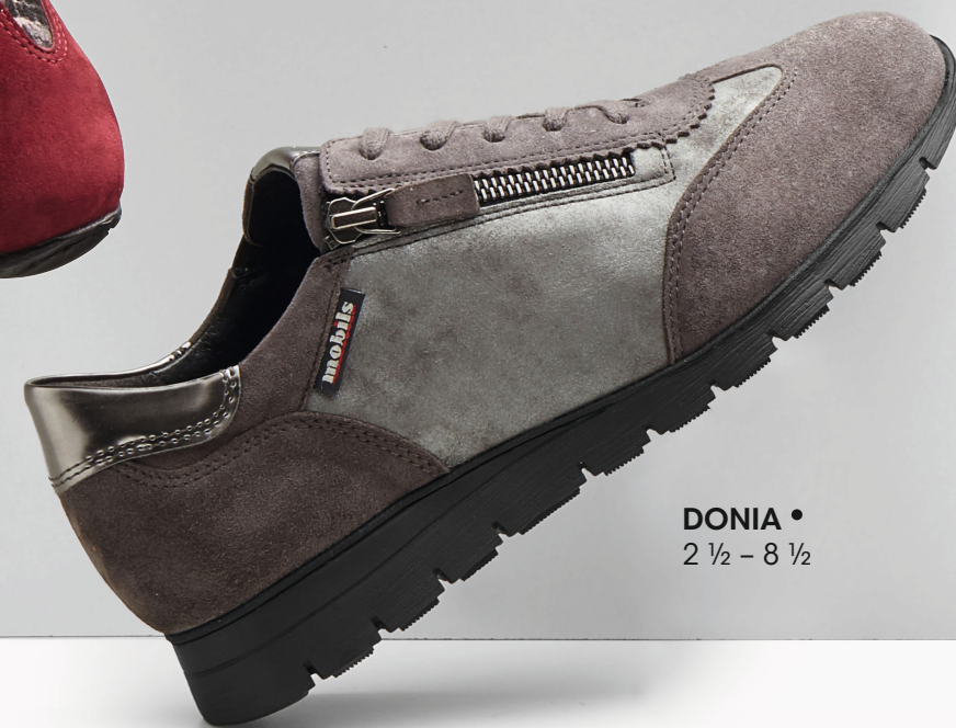
DONIA • 2 ½ – 8 ½