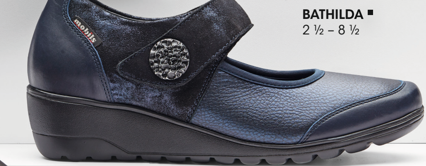
BATHILDA ■ 2 ½ – 8 ½