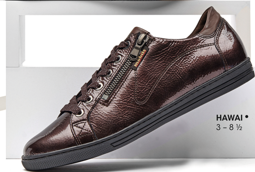
HAWAI • 3 – 8 ½