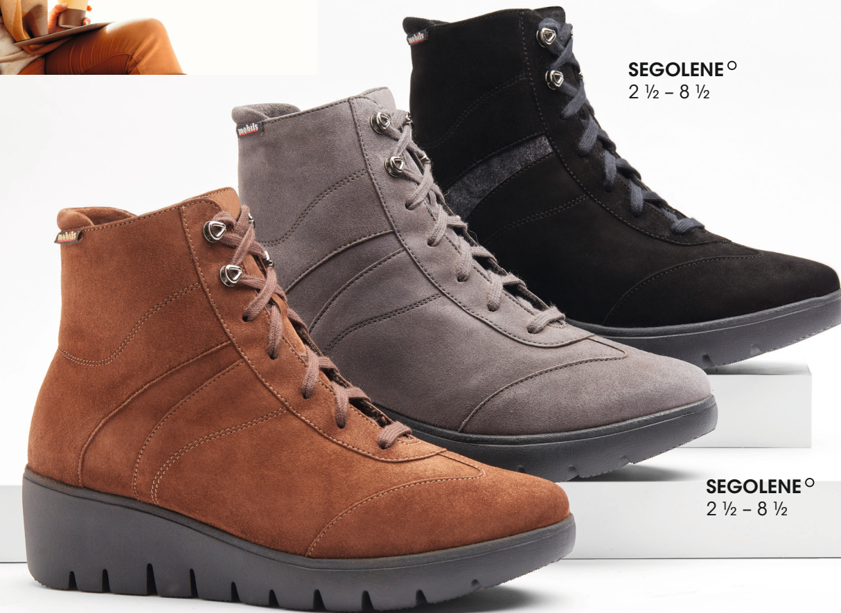
SEGOLINE ° 2 ½ – 8 ½