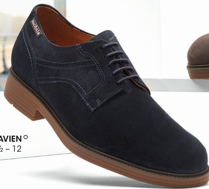
FLAVIEN° 5 ½ - 12