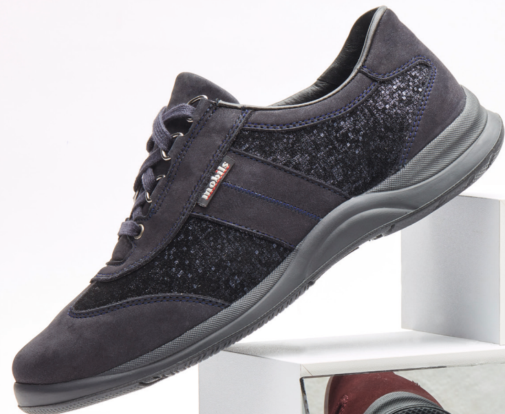
LIRIA ◯ 2 ½ – 8 ½

No matter what you have planned: MOBILS ergonomic has the perfect shoe for you. This is guaranteed with an unbelievable selection of attractive and comfortable models. Whether robust or sporty, a city or business look: with MOBILS ergonomic you can enjoy comfort while looking stylish at any occasion.