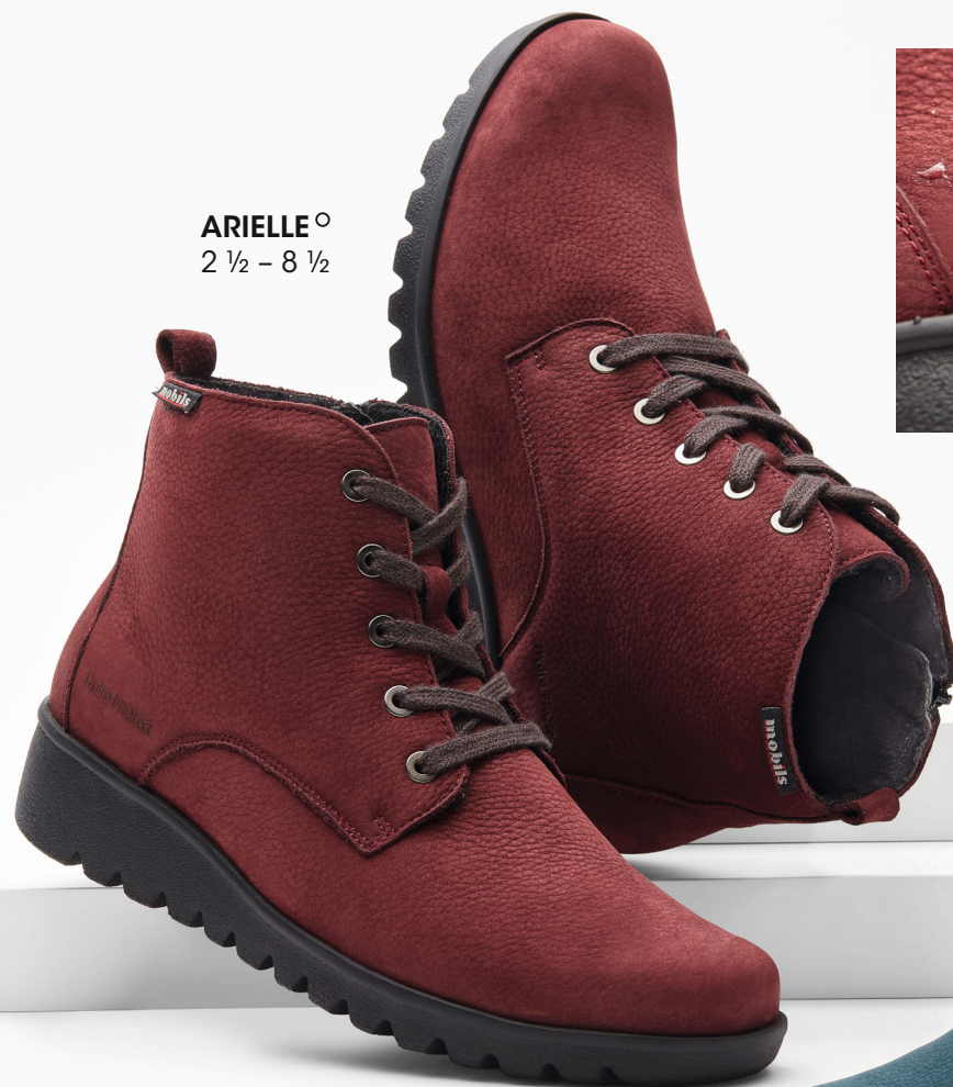
ARIELLE ° 2 ½ – 8 ½