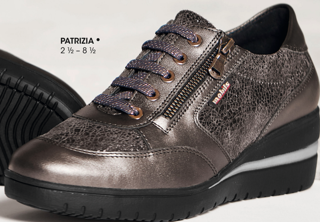
PATRIZIA • 2 ½ – 8 ½

Enjoy the feeling of walking on soft grass while wearing shoes that always provide excellent grip: MOBILS, the specialist shop, makes this possible. Stay comfortable throughout the winter months with the premium footbed and ultralight design. Your feet and joints will feel relieved even in ankle boots.