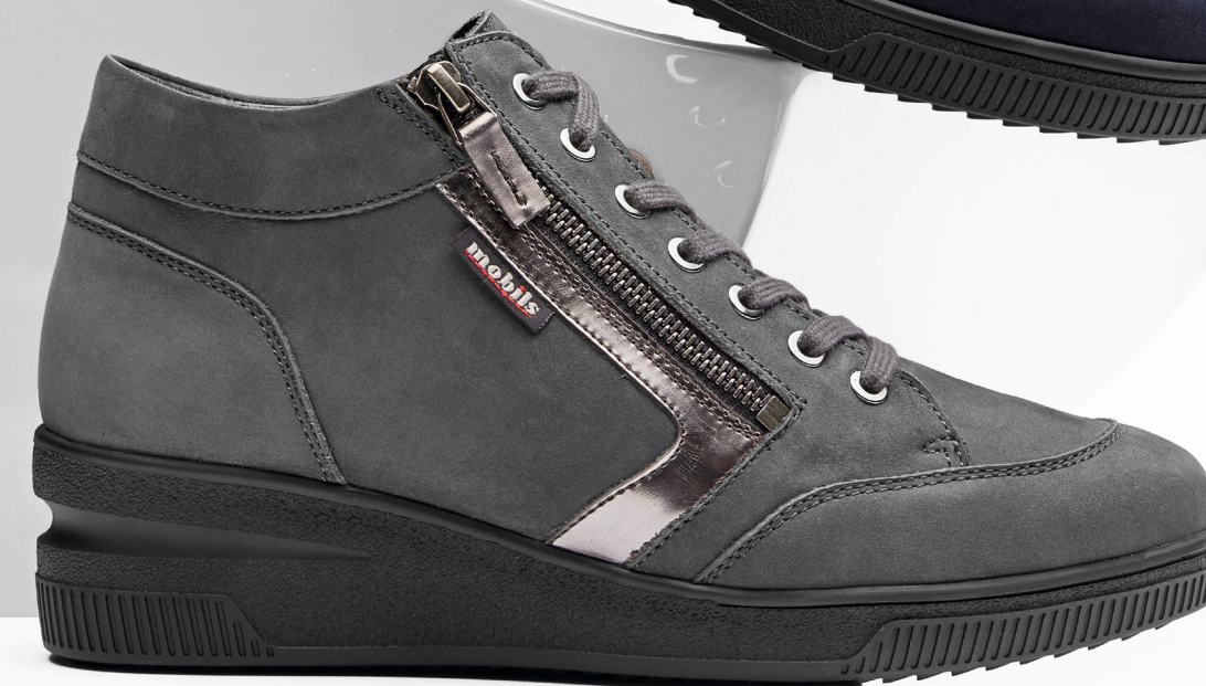
NASERA □ 2 ½ – 8 ½