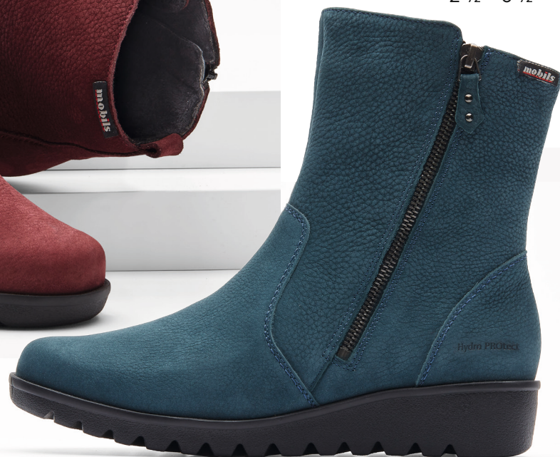
ANAI S° 2 ½ – 8 ½

▼ Additional waterproofing with Hydro PROtect : Water simply forms beads on the water-resistant leather