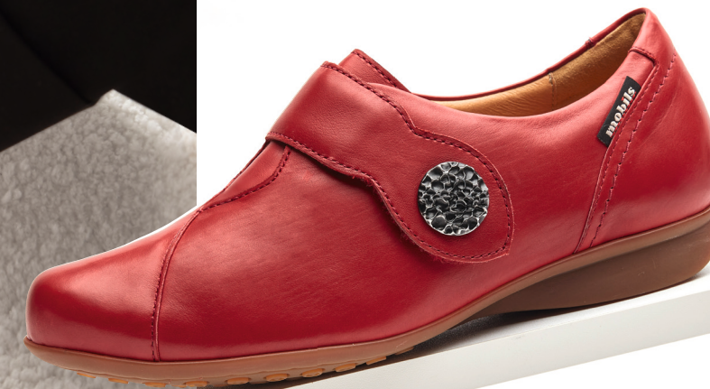
FAUSTINE • 2 ½ – 8 ½