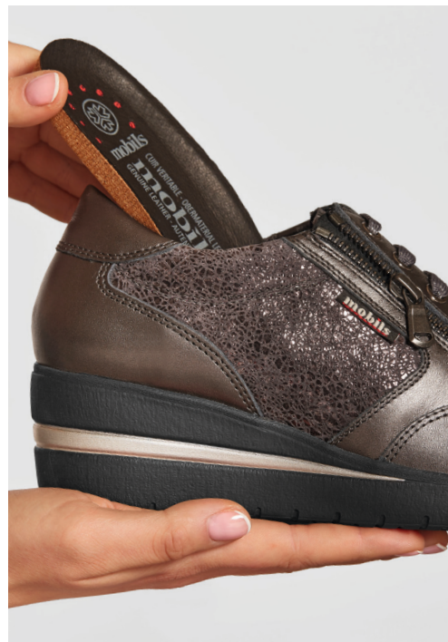
INTERCHANGEABLE INSOLE Can be replaced to accommodate custom orthotics.