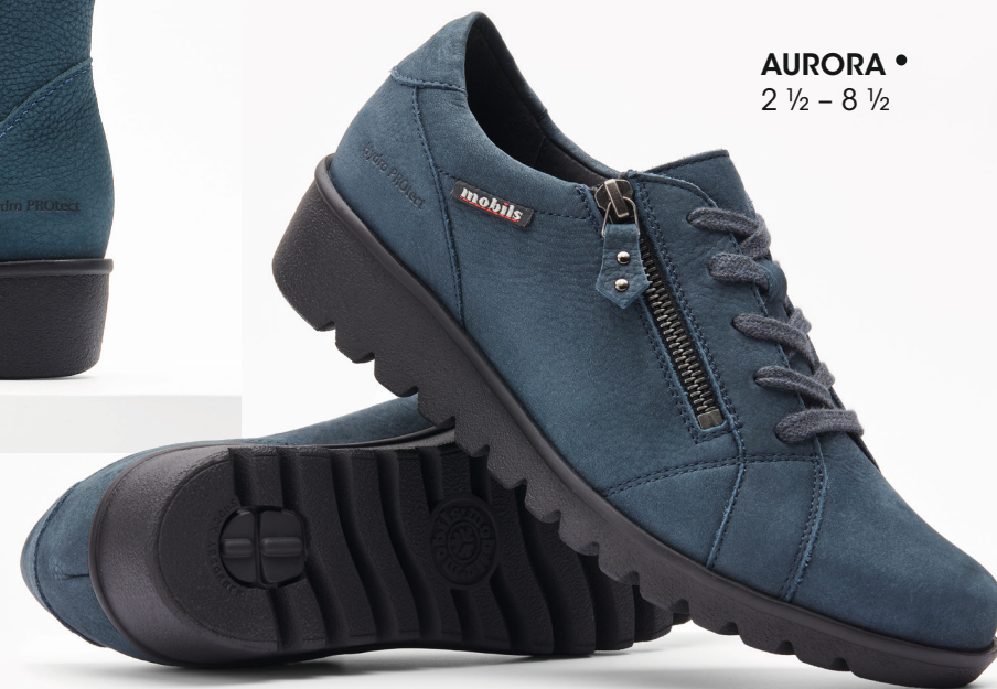
AURORA • 2 ½ – 8 ½