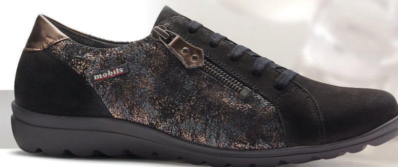
CAMILIA • 2 ½ – 8 ½

Even winter can't faze your feet: With their additional waterproofing feature, these handmade shoes produced in France will always keep your feet dry and warm thanks to their cosy fleece lining. The all-over padding between the lining and upper leather ensures optimal comfort.