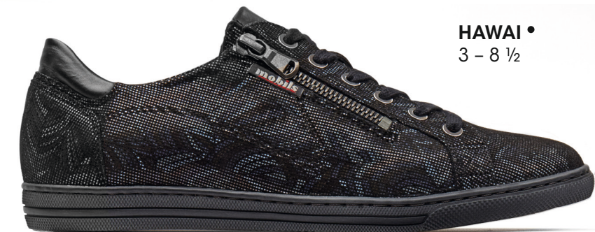
HAWAI • 3 – 8 ½