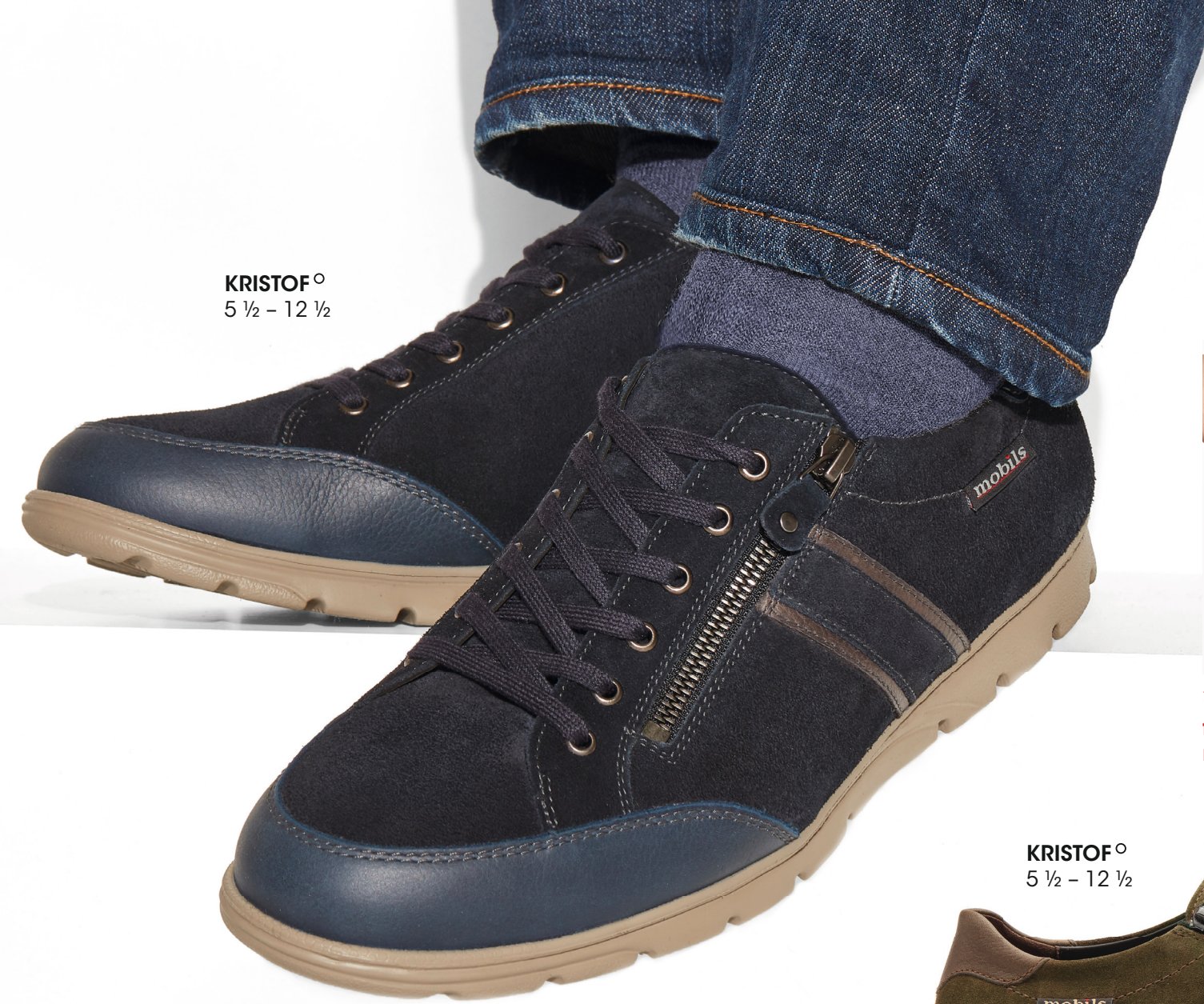
KRISTOF° 5 ½ - 12 ½