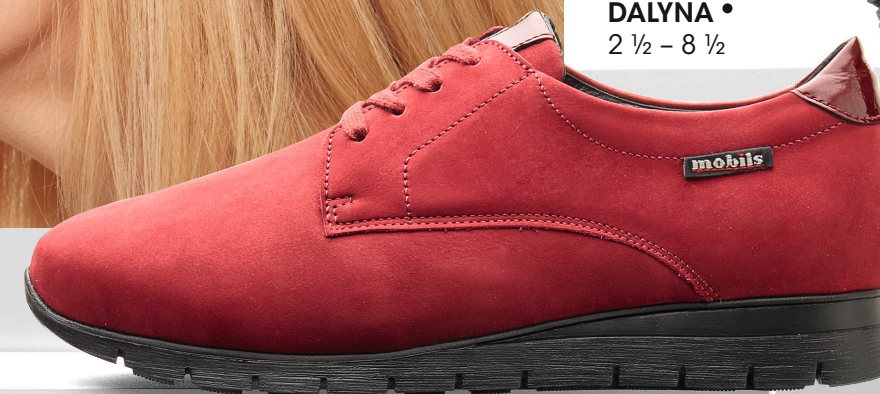
DALYNA • 2 ½ – 8 ½