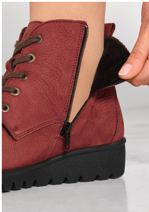
ALL-ROUND PADDING Avoids pinching and rubbing.