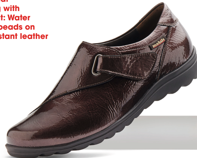
CLARISSE • 2 ½ – 8 ½

▼ Ultimate comfort: A zipper on each side allows the foot to easily slide into the ankle boot