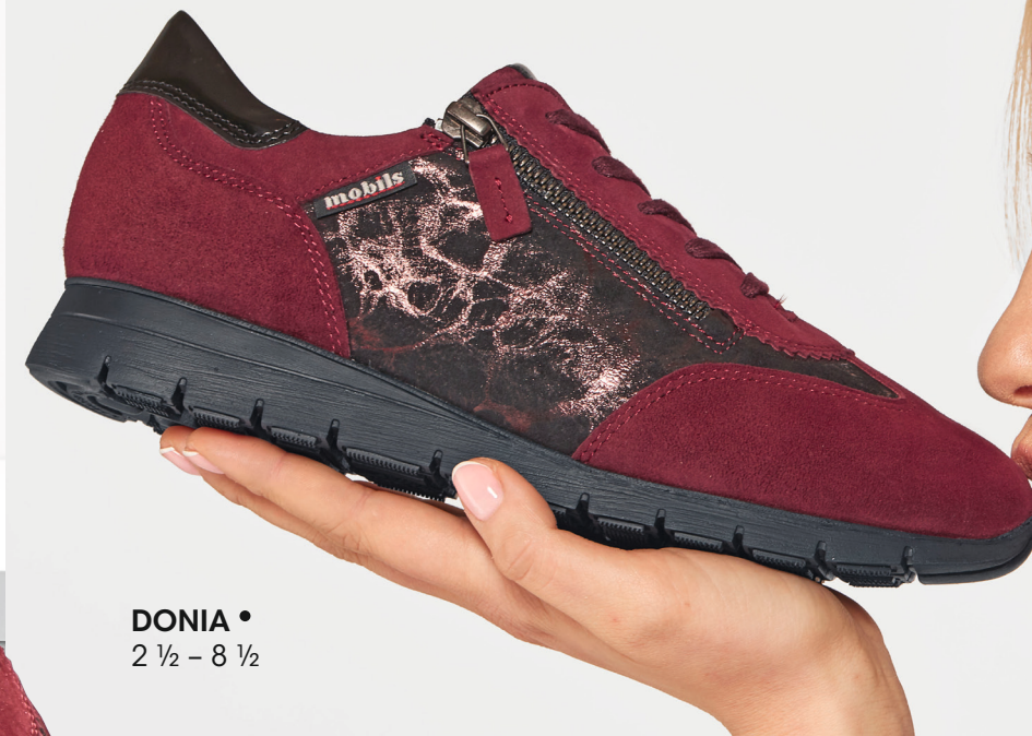
DONIA • 2 ½ – 8 ½