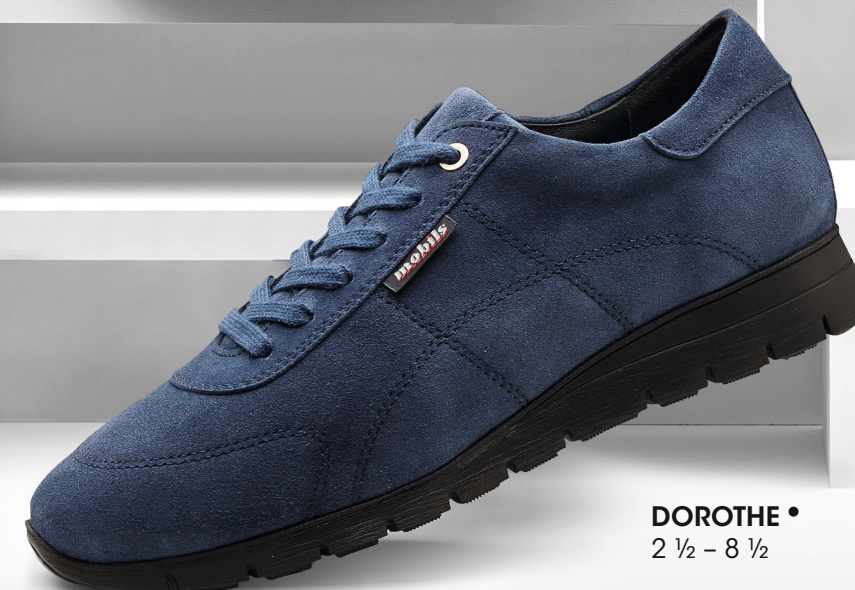
DOROTHE • 2 ½ – 8 ½