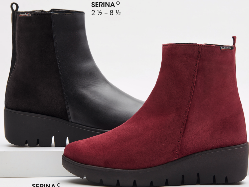
SERINA ° 2 ½ – 8 ½