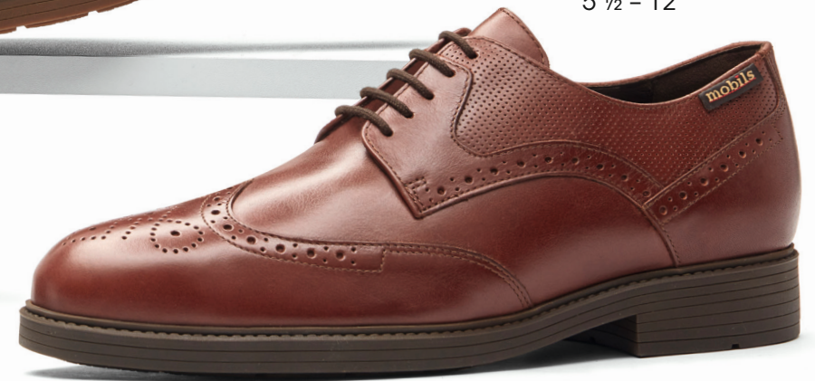
FERNAND° 5 ½ - 12