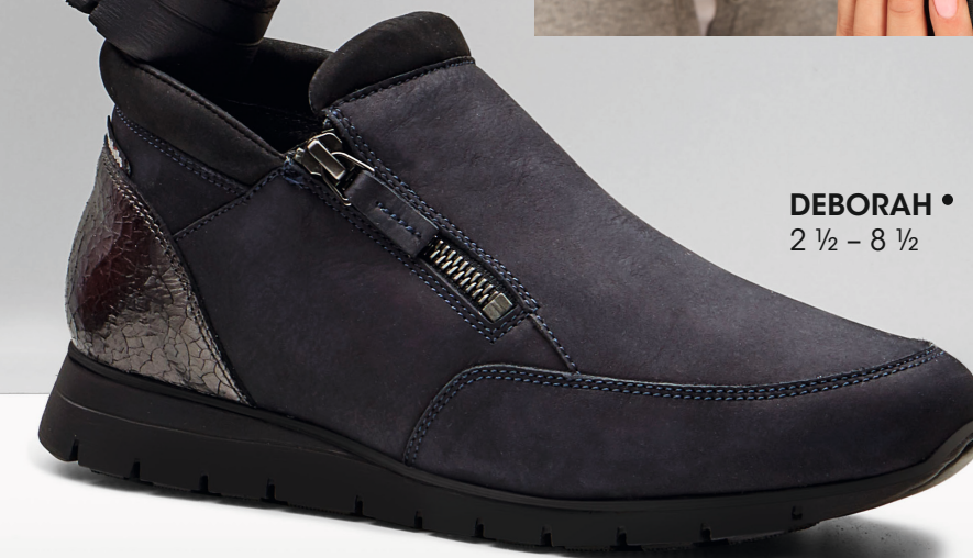
DEBORAH • 2 ½ – 8 ½

▼ The shock absorber minimizes impact to protect your back and joints.