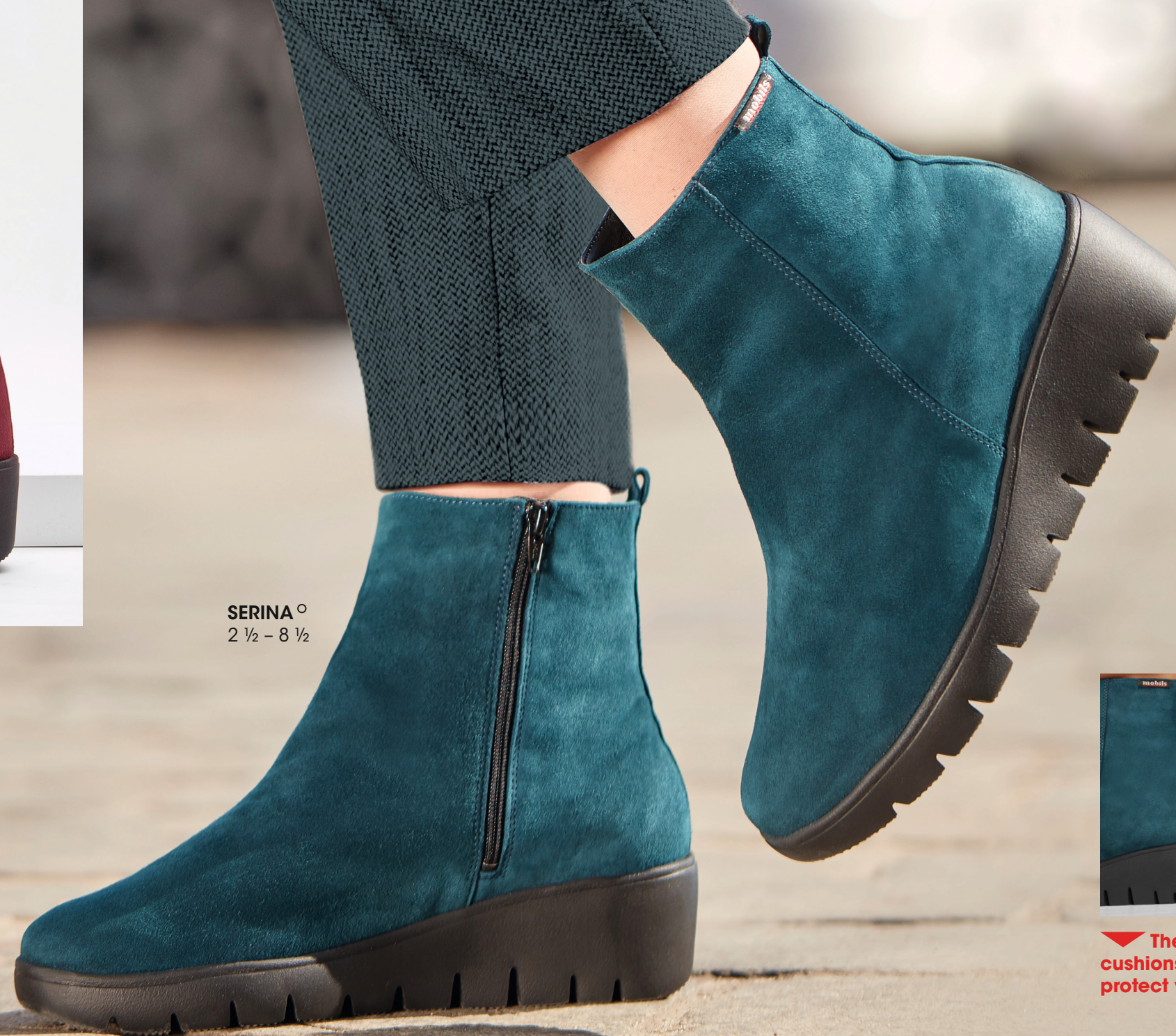
SERINA ° 2 ½ – 8 ½

New colors, great designs, maximum comfort: Anyone who wears MOBILS will love autumn and winter. Petrol and Bordeaux create accents while always staying comfortable with lightweight soles. Whether stylish, soft-lined ankle boots or high-cut models: Your feet will be sure to thank you at night.