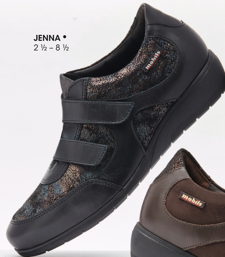
JENNA • 2 ½ – 8 ½