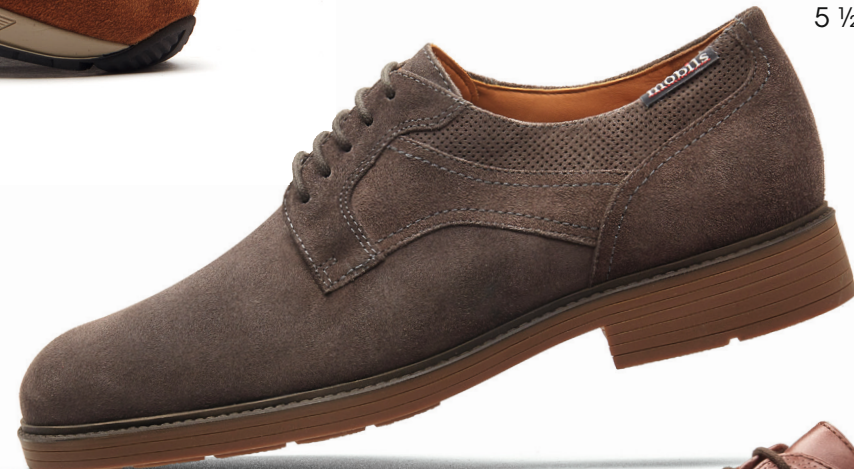
FLAVIEN° 5 ½ - 12