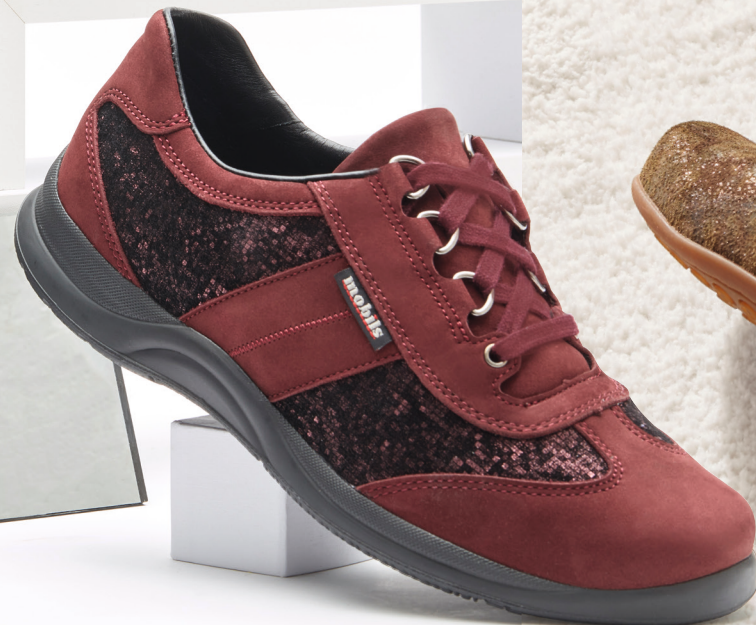
LIRIA ◯ 2 ½ – 8 ½

▼ Comfort really can be so easy: The ultralight design of MOBILS relieves the muscles and joints.