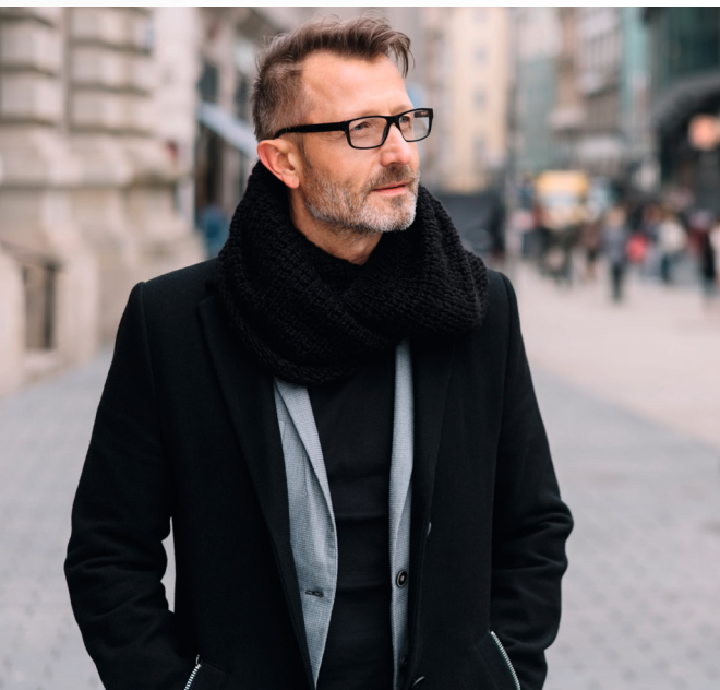
ARNAUD o 5 ½ – 13

If comfort is your top priority then you're in the right place with the MOBILS ergonomic men's collection. Here you'll find models offering ultimate comfort for every purpose. These shoes are guaranteed to meet your requirements: Getting through even the longest day without aching feet. No matter which MOBILS shoe you choose - it's your perfect match.