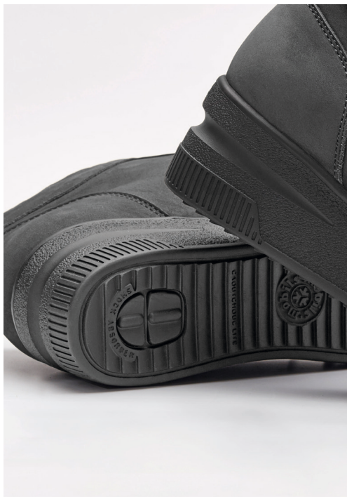
SOFT AIR TECHNOLOGY Provides soft and supple walking comfort.