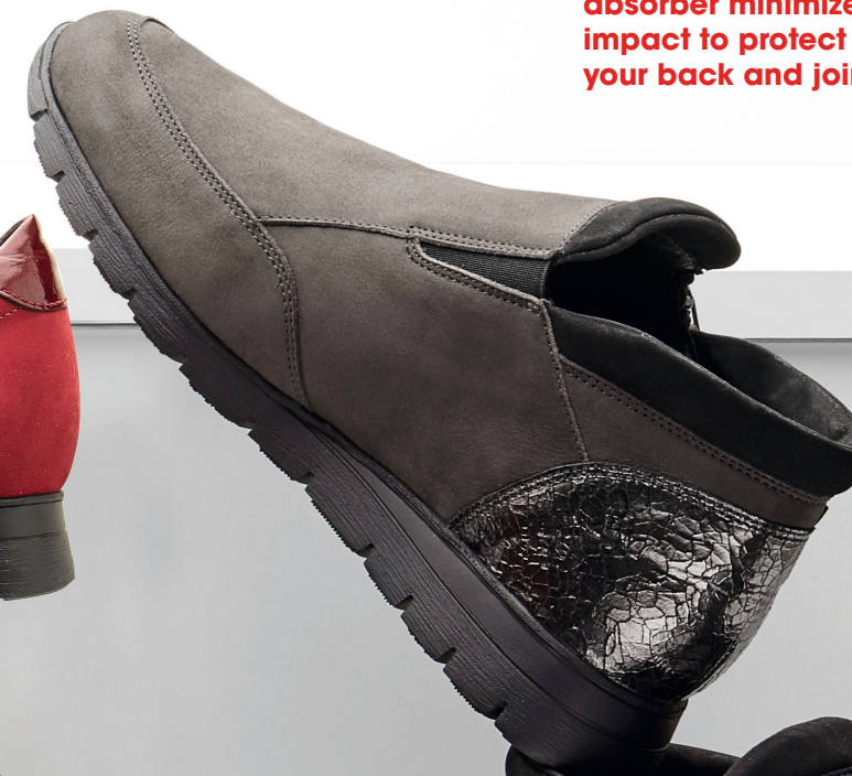
DEBORAH • 2 ½ – 8 ½